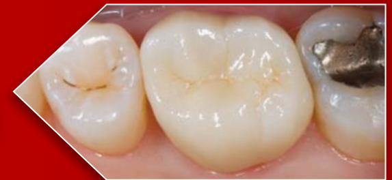
BruxZir Solid Zirconia Crown