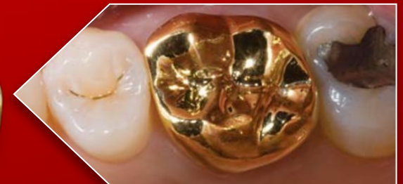
Full-Cast Gold Crown