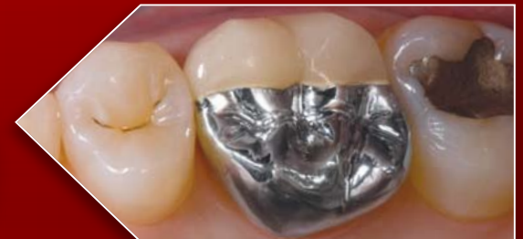
Porcelain and Metal Crown